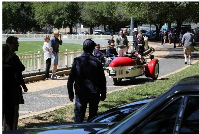
The very popular Morgan 3 wheeler doing a lap round the oval

The best of British vehicles arrived from the Sapphire coast, Southern Highlands, Bathurst & Orange, Cooma, Sydney, Wagga Wagga, Riverina, South Coast, Hunter Valley and the wider Canberra Region.