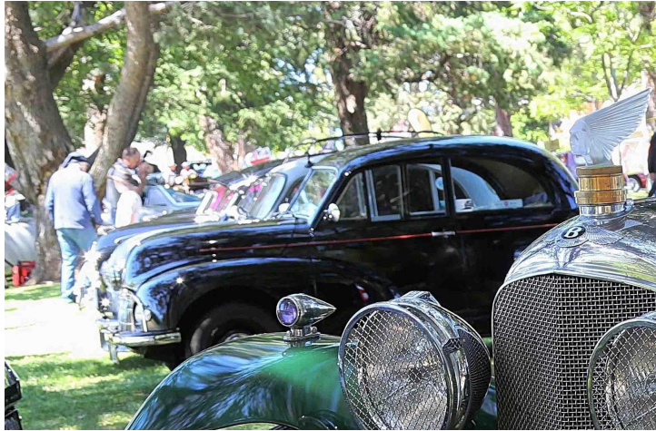
The Morris Minor low light & the Nose of the Big Bentley

The 45 th Terribly British Day, held in the Queanbeyan Park, was again a huge success, with a large crowd enjoying the first car and bike show to held since the Covid 19 virus interrupted our lives.