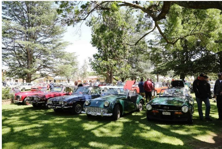
Some of the host club Triumphs, enjoying the day out

Club of the day ACT MG club won that title with a very good display of old and new vehicles. Selected by the team of the charity of the day, Respite Care for Queanbeyan.