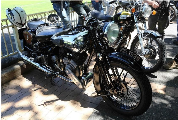
The very superior Brough Superior

The best of British vehicles arrived from the Sapphire coast, Southern Highlands, Bathurst & Orange, Cooma, Sydney, Wagga Wagga, Riverina, South Coast, Hunter Valley and the wider Canberra Region.